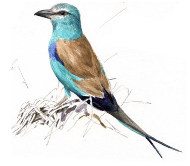
Abyssinian Roller Coracias abyssinicus

This list is the result of a first overview of the available knowledge on the avifauna of Ennedi. It will evolve rapidly and it will be reissued as we continue learning through the ongoing bird monitoring program.