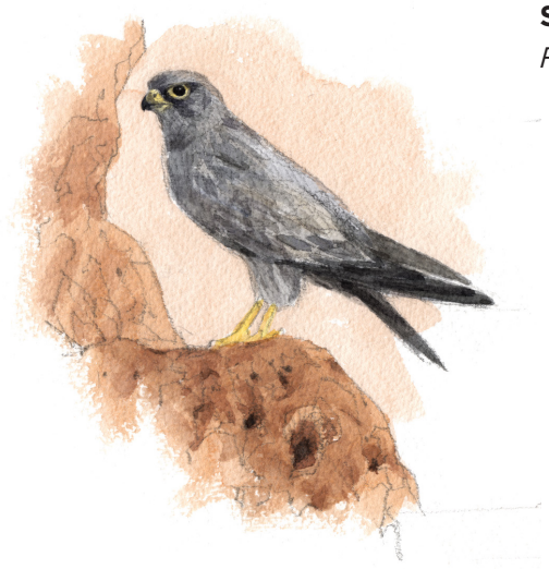
Sooty Falcon Falco concolor

African Parks would like to invite you to contribute to the ornithological census of the Ennedi Natural and Cultural Reserve, by sharing your observations – date, location, species and photographs – with the African Parks offices based in Fada and N'Djamena (rnce@africanparks.org), or with the West African Bird Database (www.wabdab.org).